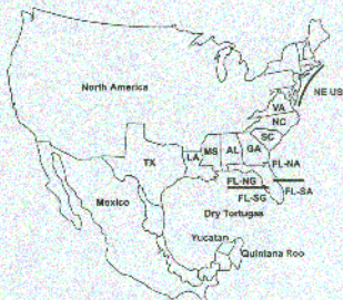
Fig. 1 Map indicating the location of sampled rookeries and foraging grounds in North America. For abbreviations see Tables 1 and 2. Divisions between FL-NA and FL-SA and between FL-NG and FL-SG are indicated by dark bars at Cape Canaveral and Tampa Bay, respectively.

These mtDNA surveys invoke the possibility that loggerhead turtles have two distinct homing migrations: the well-known reproductive migration, that brings adults back to their ancestral breeding areas, plus a juvenile migration that brings oceanic migrants to neritic feeding habitats near their location of origin. If juvenile homing occurs in the north-western Atlantic, how precise is this behaviour? Do older juvenile turtles return to a broad region of the western Atlantic, or do they tend to recruit to feeding grounds near their rookery of origin? The latter possibility